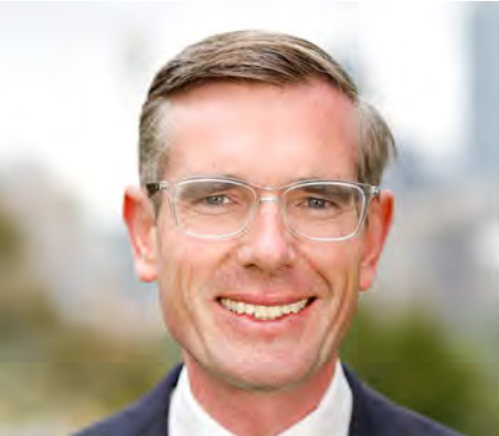
Dominic Perrottet MP Premier of New South Wales