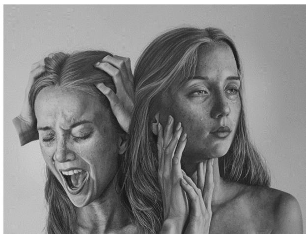
Ariel D – Graphite drawing