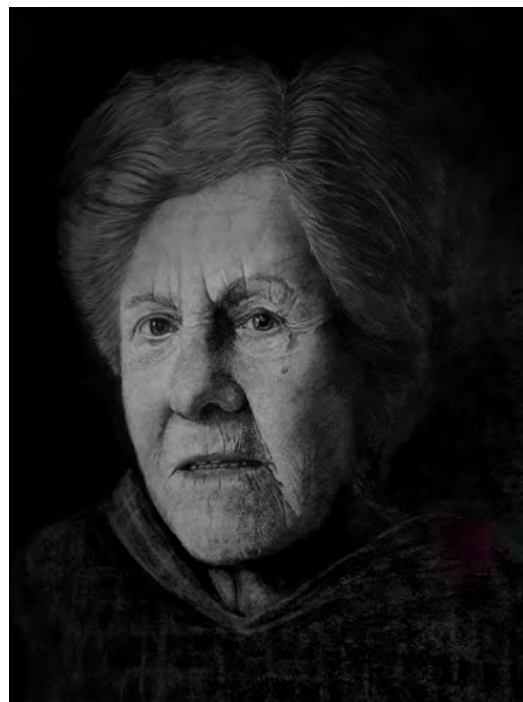
Kirra D – Charcoal drawing