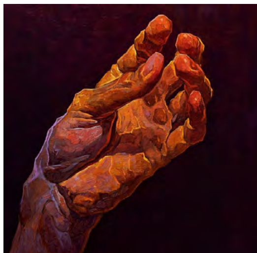
Erin P - Painting

The following images represent a section of each these student's body of work.