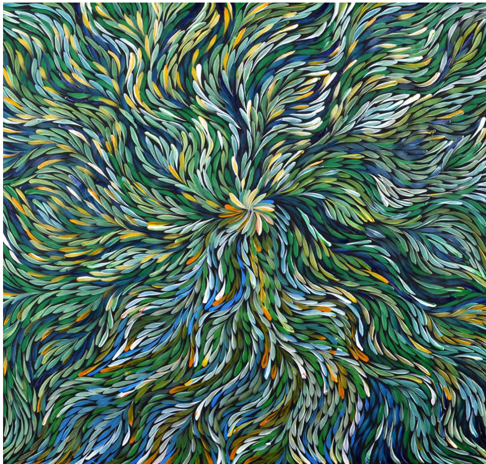
Bush Leaves (detail) © Janet Golder Kngwarreye * Licensed by Viscopy