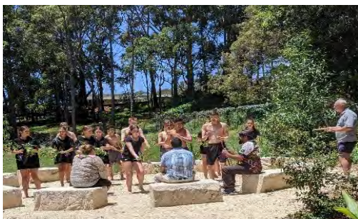
Terrigal High School Aboriginal Education Team

Once our trusted teacher believed that they were well intended, the newcomer can then enter with the boys whose spears are now lowered. Following this the newcomer takes part in a cleansing ceremony where our girls brush away any bad spirits from the newcomer's past with the use of gum leaves. To finish the ceremony our students performed a welcome dance to wish the newcomers a safe journey here at Terrigal High School.