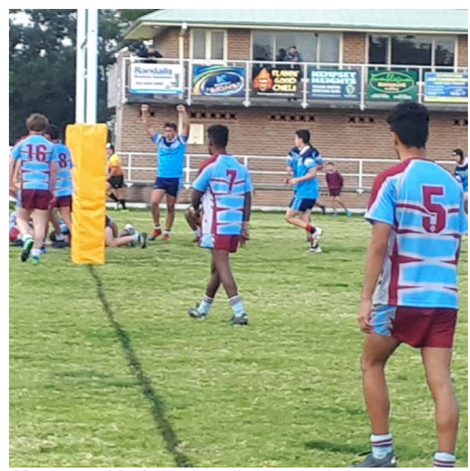
Above and below: A well-deserved victory.